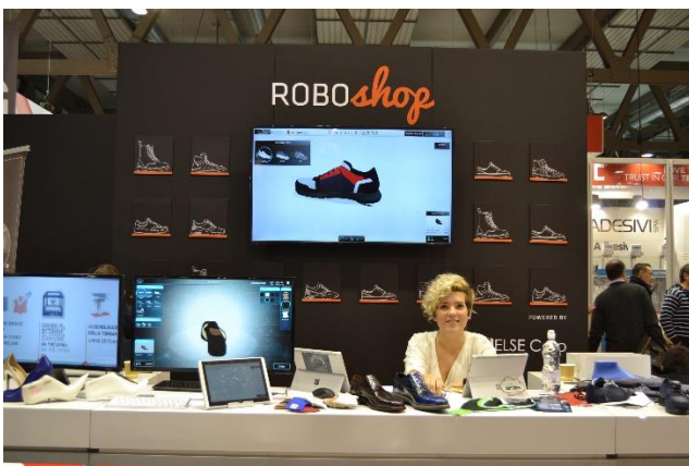
Fig. 2. The starting point of the Innovation Arena in 2018 called RoboShop

In the updated version of the project, which was shown in February 2018, RoboShop , demonstrated an "assemble-to-order" process for ultra-rapid footwear manufacturing in the store-factory of the future where a customer's personalization and purchasing experiences merged with the live experience of the manufacturing of their own shoes, in a perfect digital fabrication scenario. The setting was completely digital, starting from the first phase of 3D CAD modelling of the RoboShoe collection by Shoemaster, to their customization and order processing in ELSE Corp's else.shoes™ platform and to the robotic production by ATOMLab. Taking into account the significant new updates to the functionalities of ELSE Corp's else.shoes™ platform, specifically to its MyStyle SDK for Product Style Customization in 3D and MySize SDK, for 3D Foot Scanning and Virtual Fitting; the 'RoboShop' in the updated version of the project offered new features and was able to recommend to a customer their 'Best-Fit' in terms of size and style.