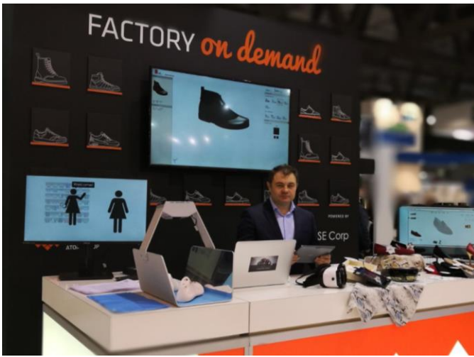
Fig. 1. The starting point of the 'Factory on Demand' in 2017 called the Virtual Shop

CAD integration for mass customized footwear, from design of the product to retail sale and from the customized sale to the modular and on demand production.